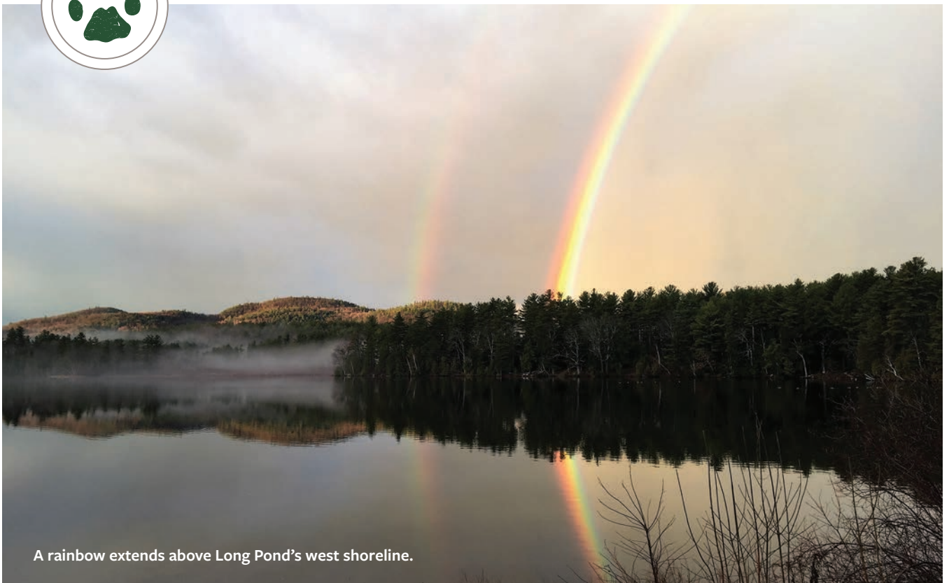
A rainbow extends above Long Pond's west shoreline.