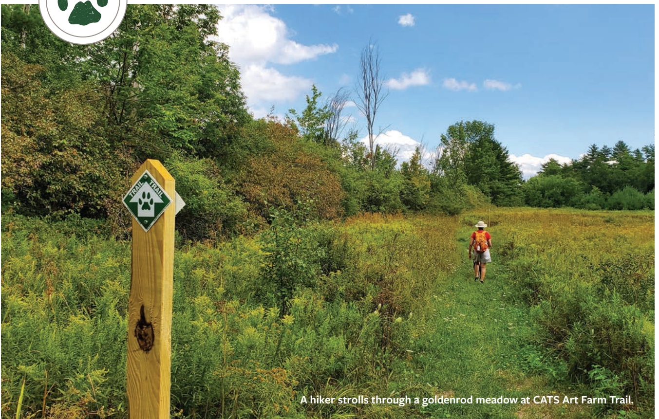
A hiker strolls through a goldenrod meadow at CATS Art Farm Trail.