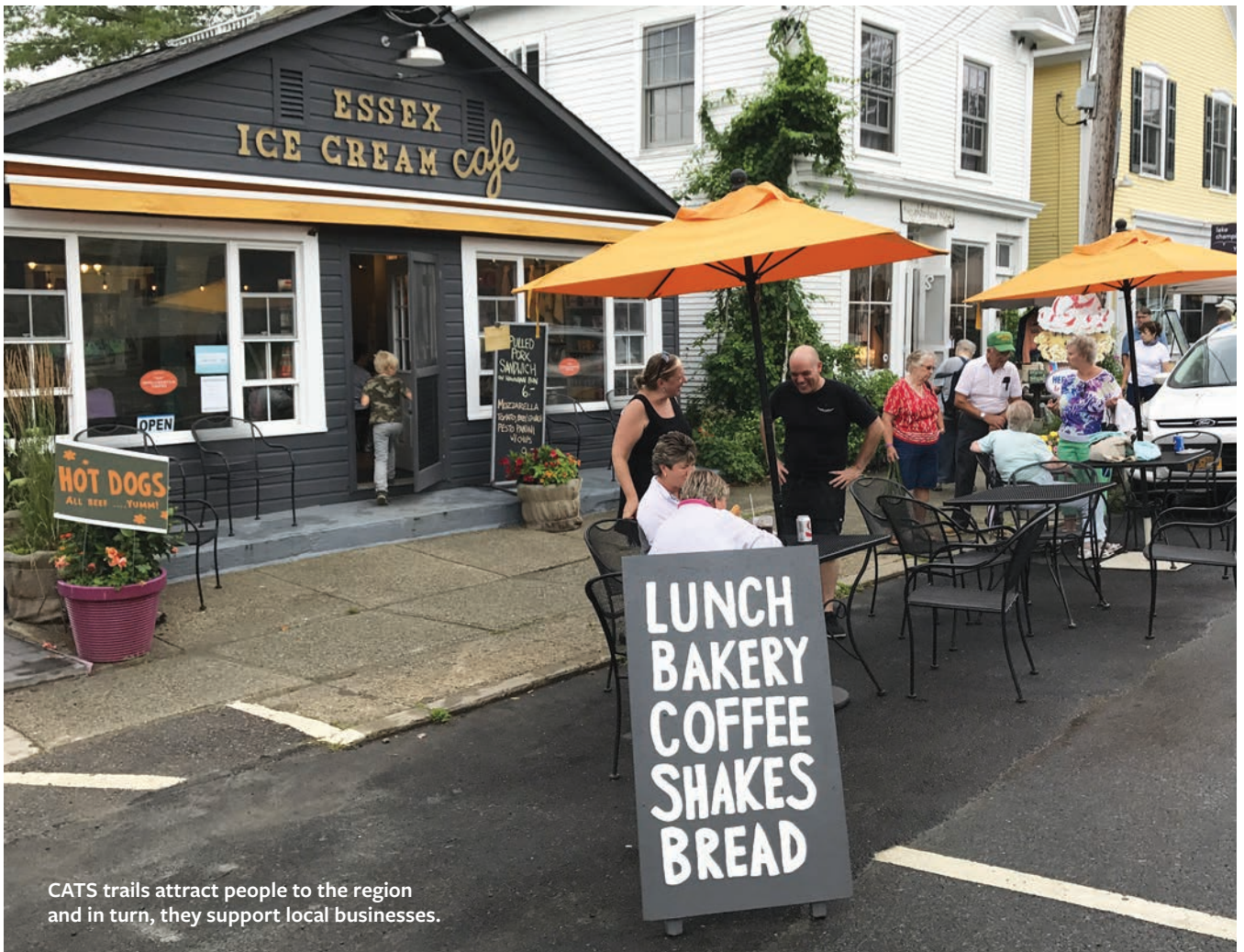
CATS trails attract people to the region and in turn, they support local businesses.